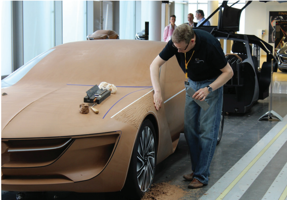
Figure 3: A clay model of a car