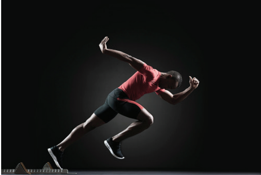
Figure 1: Athlete in sports laboratory