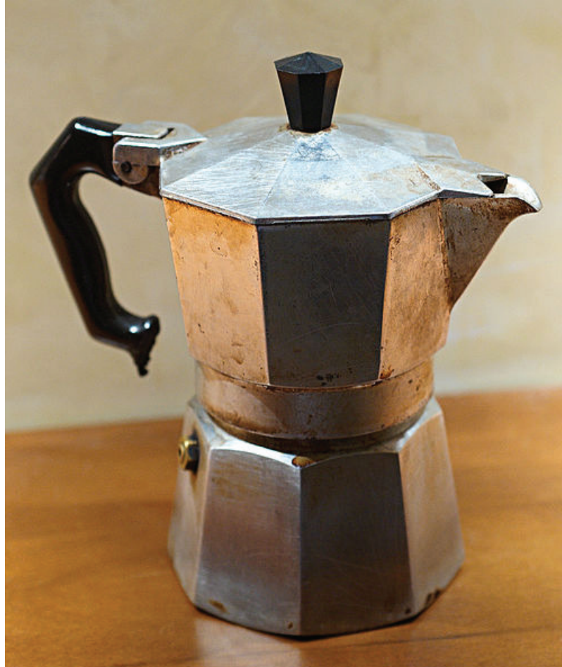
Figure 6: A coffee maker