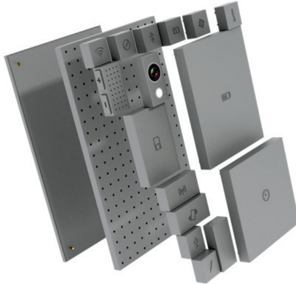
Figure 5: Phonebloks